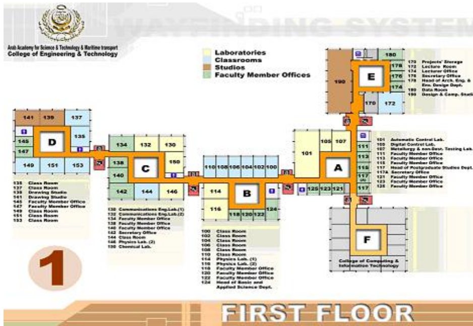
Figure 3 First Floor -College of Engineering and Technology