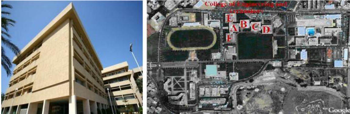
Figure 1 College of Engineering and Technology

The College of Engineering occupies five buildings (A, B, C, D, and E) (with total area of approximately 5000 square meter as shown in Figure (1)). Each building includes spaces allocated for class rooms, faculty offices, lecture halls, technical laboratories, workshops, libraries and other academic activates. Each floor in the building is connected with the neighboring building floor