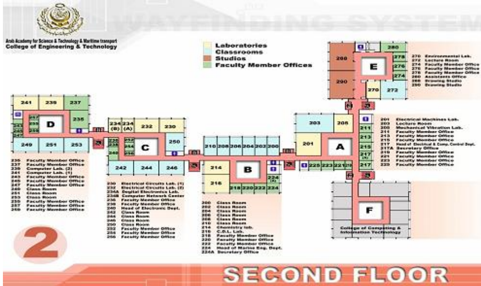
Figure 4 Second Floor -College of Engineering and Technology