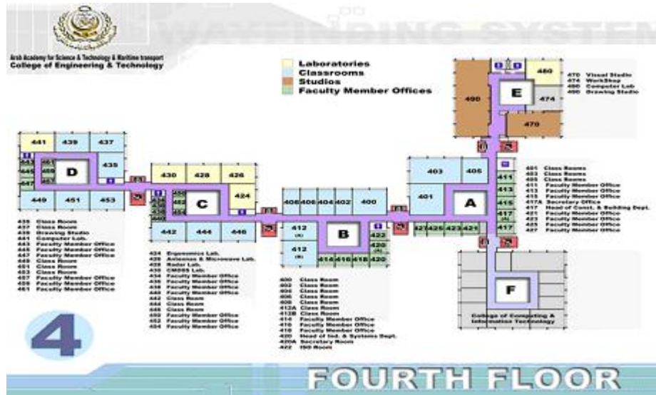
Figure 6 Fourth Floor - College of Engineering and Technology