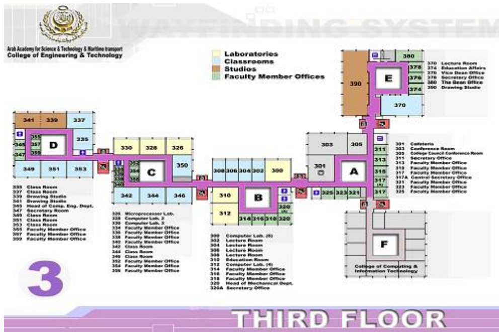
Figure 5 Third Floor -College of Engineering and Technology