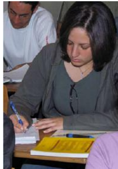
Fig7-Classrooms provides a good learning environment

The classrooms are located in the neighboring Building B & D. The program utilizes 9 well-equipped classrooms. Some are equipped with a suitable blackboard and illumination, a high-resolution projector capable of displaying video and computer images mounted on the ceiling to serve the interests of both students and staff and fulfill the educational objectives and outcomes of the program.