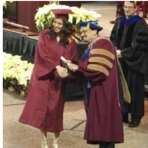
BIS Student Exchange at Central Michigan University, USA