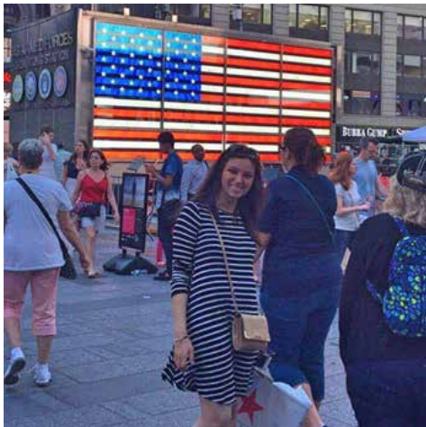
Summer Internship in USA